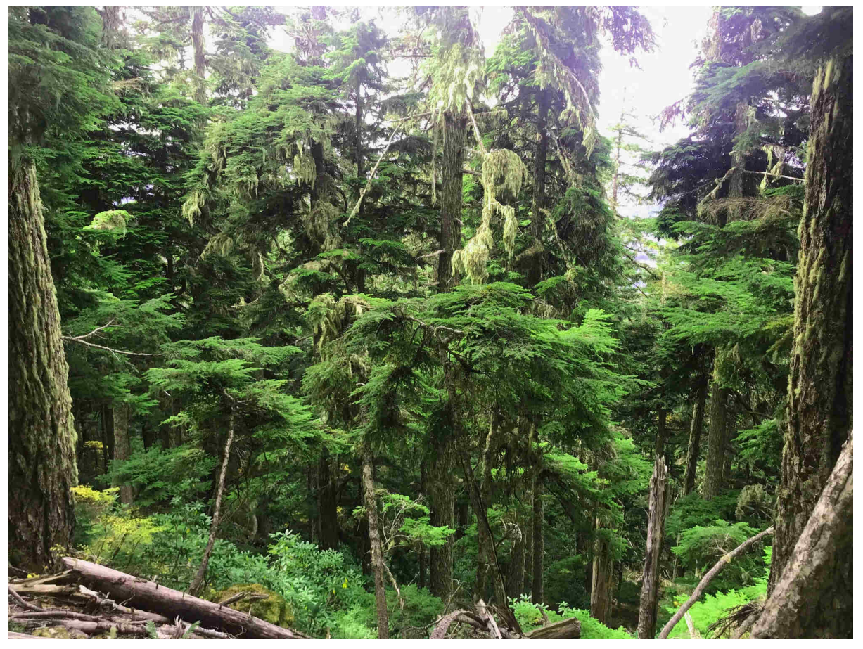
A moss-filled glimpse into the remnant old-growth stand on the newly acquired Henry Creek property.