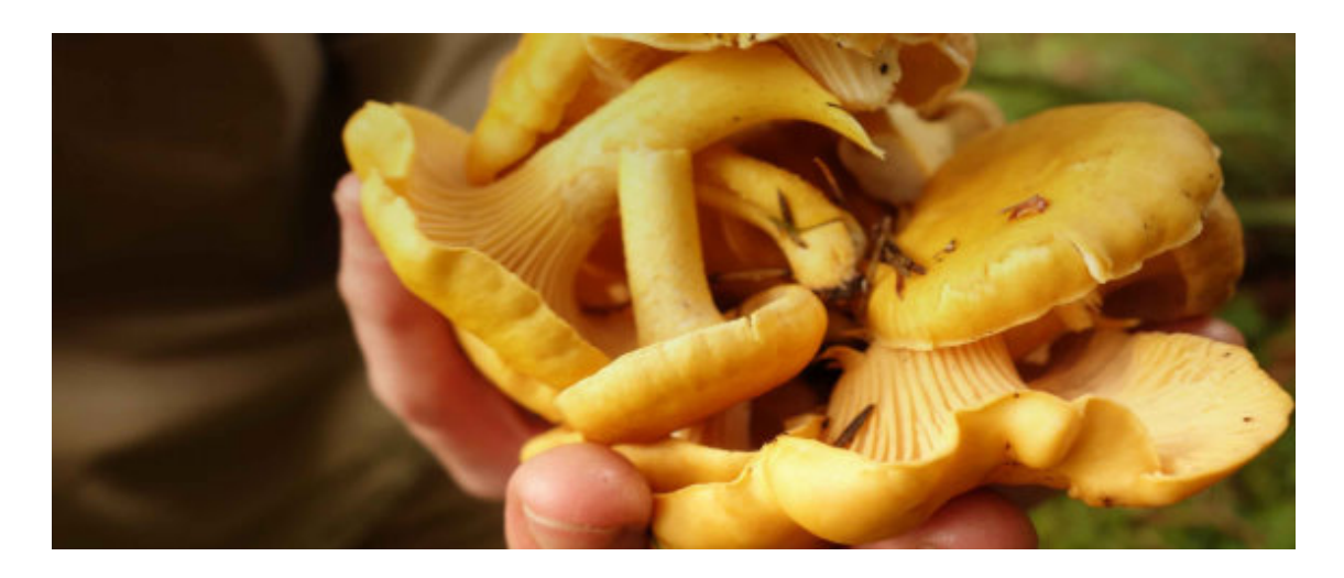
Wild Forest Mushrooms

2019 was a banner year for wild mushrooms, one of many valuable non-timber forest products being explored by EFM for our foraged forest foods line.