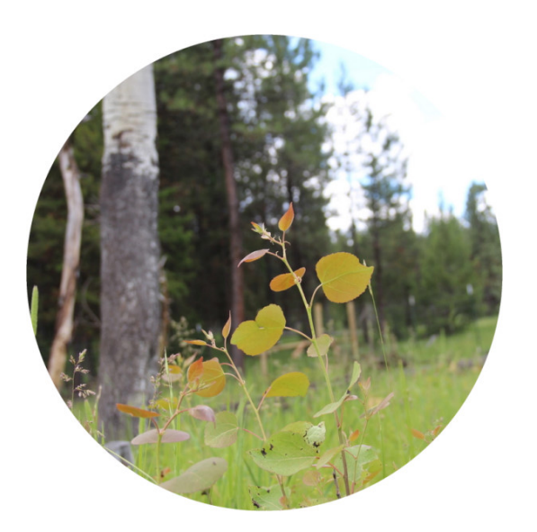
New Webinar and Podcast

EFM is now a U.N. Principals for Responsible Investment (PRI) Signatory, demonstrating our ongoing commitment to the international impact investing community and to building shared investment principles. To learn more about forestry and the U.N. Sustainable Development Goals (SDGs) see our new page here.