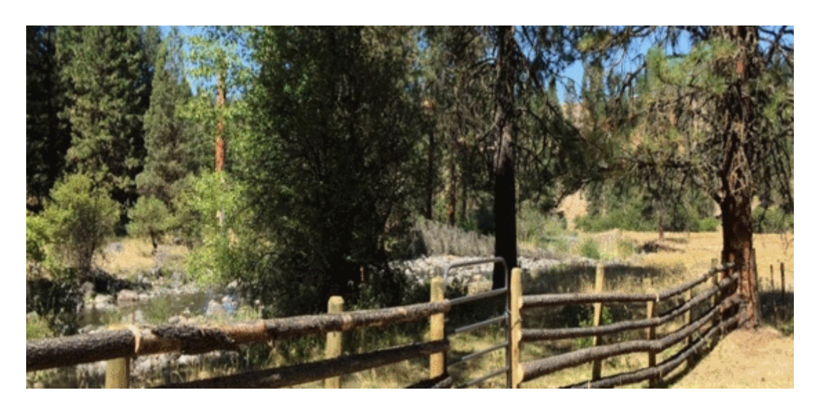
Restoring Desolation Creek

2019 was a banner year for wild mushrooms, one of many valuable non-timber forest products being explored by EFM for our foraged forest foods line.